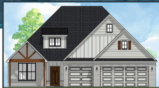
ELEVATION STYLE B